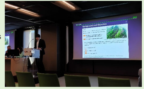
Presentation at an international conference (Firenze, Italy)

During the preparation of my application, I tried to present the impact of my research more generally, in a way that would be well understood by people outside my field of expertise. Sometimes, the easy-to-understand expressions lose their strict 'engineering/scientific' meaning, but I think it is important to strike a good balance between the smooth communication and accurate articulation of our research. Writing an application is a repetitive and difficult process that involves many revisions, nonetheless I believe that this is a very good training for better communicating and presenting the appeal and significance of your research to a much wider audience. I wish you all the best in your endeavors.