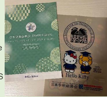
JSPS Friendship Meeting

One important point I emphasized in the application process was to have many people read my application. I started preparing my application around February and received advice from my advisor and other graduate students. I also asked my family and friends who were not involved in research to read my application, because many JSPS reviewers are not experts in my field. I think it is very important to "write in a way that people without background knowledge of the research can understand. I wish you all the best.